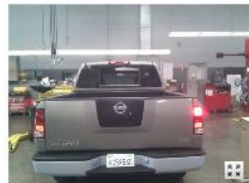
RO #30869 Brake Light Bulb