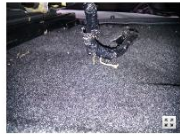
RO #30895 Infestation