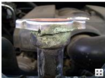
RO #30903 Radiator Cap