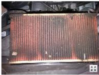
RO #30895 Air Filter

Please click on your photo for additional information regarding your repair.