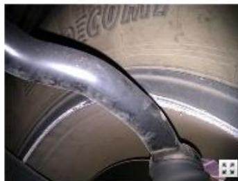
RO #30847 Tie Rod