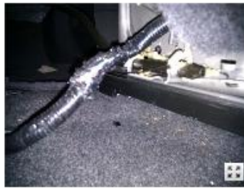
RO #30895 Infestation